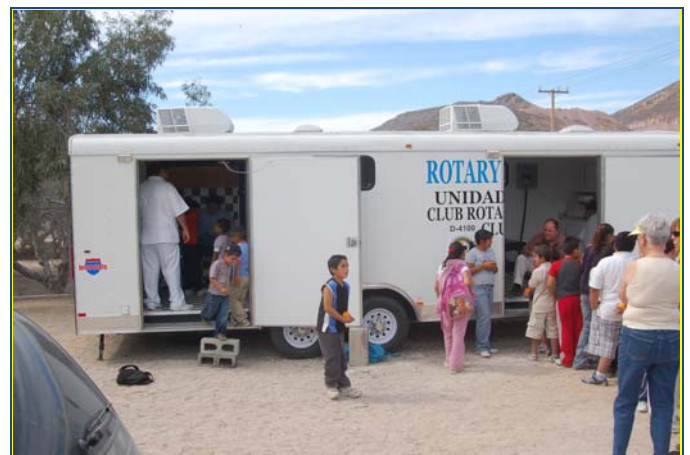
Club Rotario La Paz Balandra continues to provide medical consultations to children of the colonias.

Muchas gracias to Tortilleria Rosita I y II for their generous help with our programs. Please support them too.