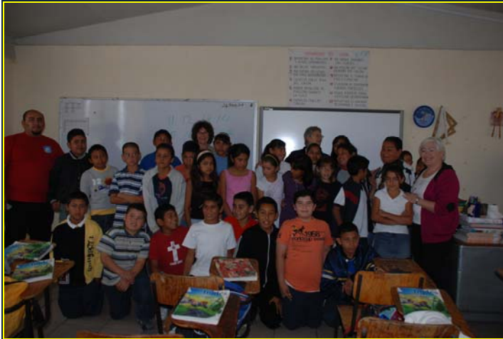
5 th grade class at Colonia Márquez de León

Here the streets are desert dirt, the homes are small and simple, some made out of scraps of this and that. This is the La Paz you don't see from the Malecon, the mall or tourist brochures. This is one of the colonias where the Fundación Ayuda de Niños La Paz (FANLAP) helps to ensure that children have at least one meal a day.