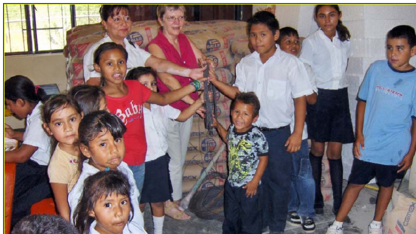
Children celebrating the beginning of the library project

For more information about the Fundación Ayuda Niños La Paz, A.C. or this Boletín Informativo, visit our website: www.lapazninos.org