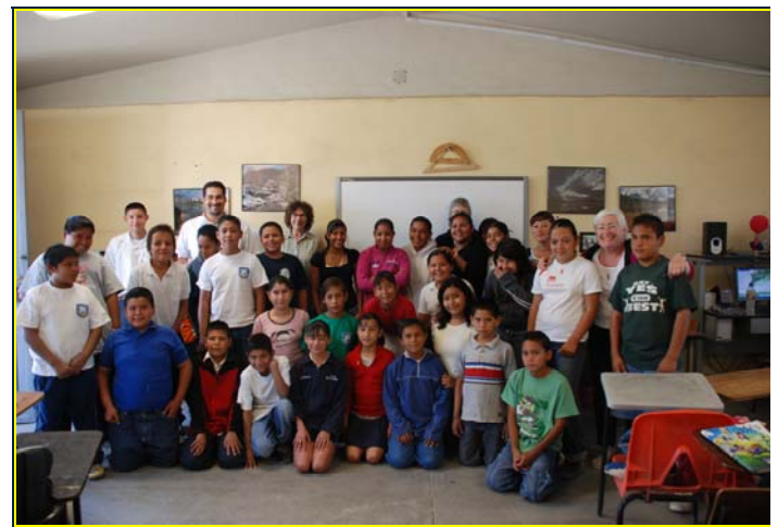
6 th grade class at Colonia Márquez de León

Our classes are full of individual participation, applause for accomplishments and smiles. Sometimes, students struggle with a concept and we and they are rewarded when their faces light with understanding.